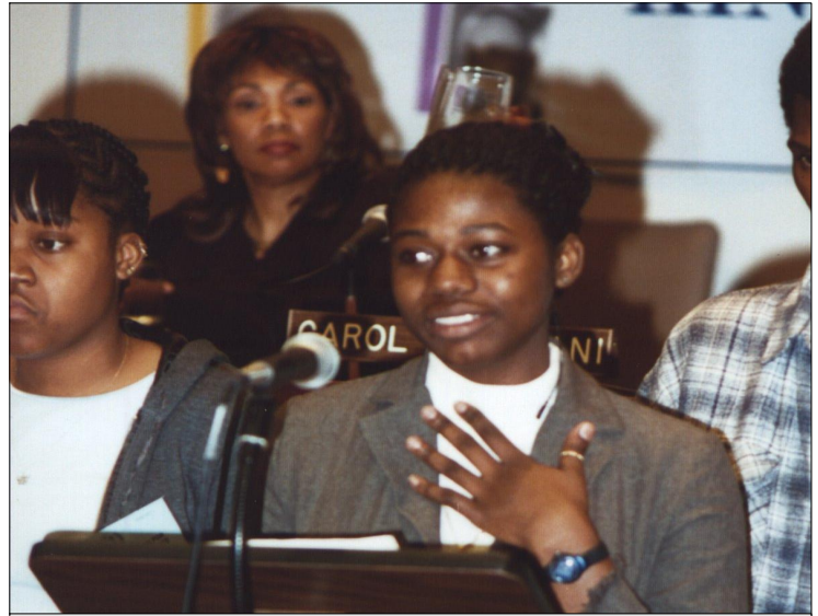
Global Kids at the UN for the Gandhi-King Season for Nonviolence