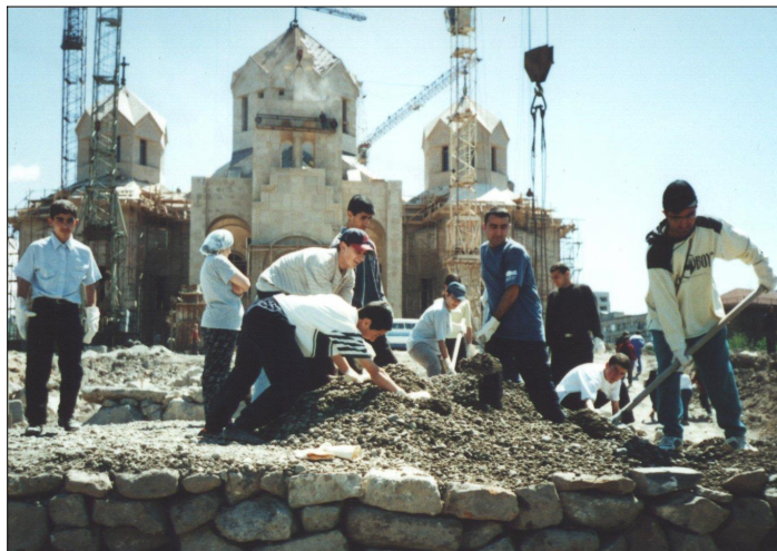
Global Youth Service Day 2001 in Armenia

GLOBAL KIDS , GLOBAL YOUTH CONNECT , and GLOBAL YOUTH ACTION NETWORK (see pg. 2) have world-wide impact. GLOBAL KIDS can boast a number of prestigious awards, and recently won the third Gandhi/