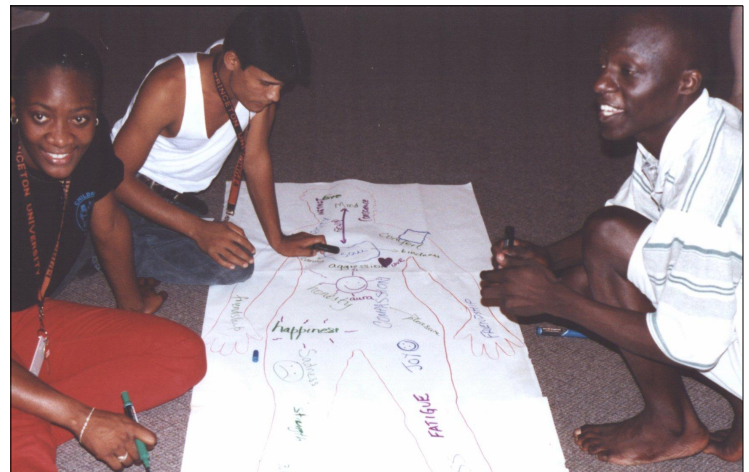
Global Youth Connect Learning Community

This article draws heavily on information provided by the Secretary-General in his report on Financing for Development. To find out more about the conference, visit www.UN.org/esa .