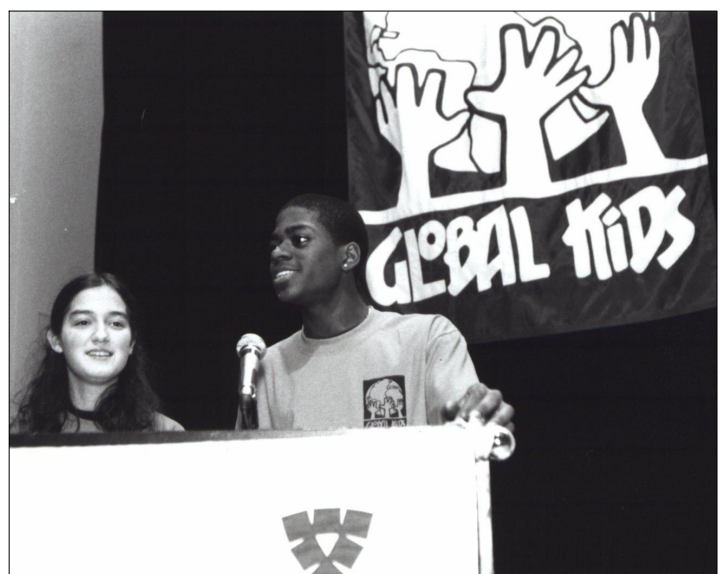
Global Kids leaders in Croatia

For more information on this and other youth surveys, visit www.youthlink.org