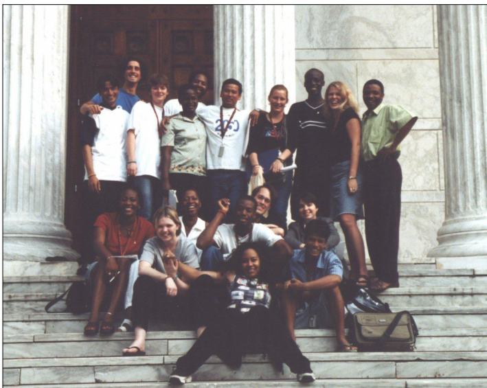
Global Youth Connect Learning Community

In the field of higher education, SCHUMACHER