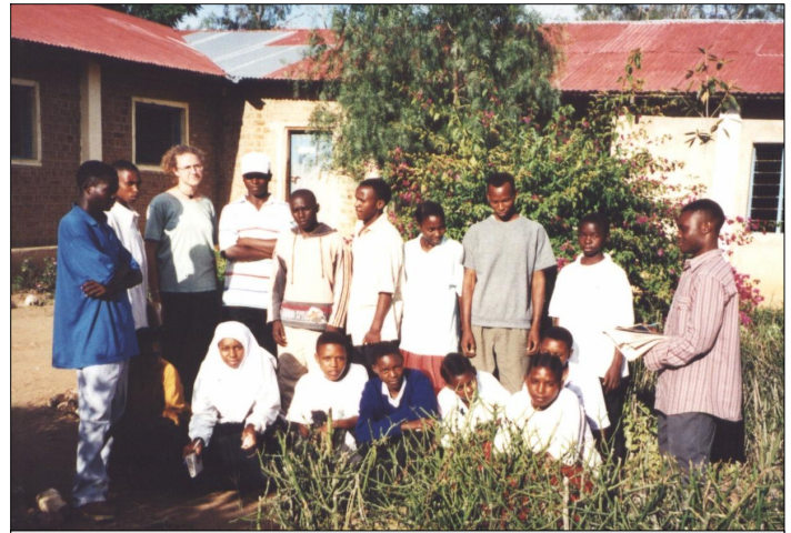
Jifunze Project in Kibaya, Tanzania

Financing for Development will attempt to engage donor countries, Bretton Woods institutions such as the World Bank, the International Monetary Fund and the World Trade Organization, and large transnational corporations in a commitment to end poverty and hunger and to craft long term economic solutions that benefit all of humanity. It will seek to transform these entities at the most basic and systemic levels